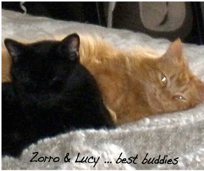
Zorro & Lucy ... best buddies

Cleo and Tony (formerly Henrietta and Wiffle) were found in a filthy, noisy granary with their parents, and rats, and raccoons. When I took them in as fosters they were terrified of everything and they didn't want me anywhere near them. With a lot of love and patience, over time, they became very affectionate little kitties. I fell in love with them and just had to adopt them.